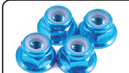
FTM48F – FASTRAX M4 BLUE FLANGED LOCKNUTS (4PCS)