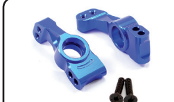
FTX6363 – FTX CARNAGE 2.0 ALUM REAR HUB CARRIER (2PCS)