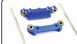
FTX6362 – FTX CARNAGE 2.0 ALUM. REAR SUSP. HOLDERS 1SET