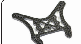
FTX6388 – FTX VANTAGE PRO REAR CARBON SHOCK TOWER