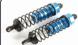
FTX6356 – FTX VANTAGE ALUMINIUM FRONT SHOCK (2PCS)