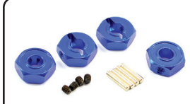
FTX6365 – FTX CARNAGE 2.0 ALUMINIUM WHEEL HUB (4PCS)