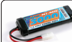
VZ0015 – VOLTZ 3000MAH NIMH STICK BATTERY PACK 7.2V