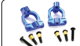
FTX6368 – FTX CARNAGE 2.0 ALUMINIUM KNUCKLE ARMS (2PCS)