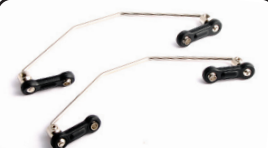
FTX6375/6 – FTX VANTAGE SWAY BAR 2 SETS