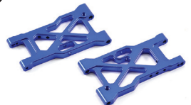
FTX6371 – FTX VANTAGE FRONT LOWER SUSP. ARM (AL.) 2PCS