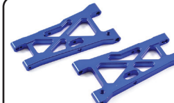
FTX6372 – FTX VANTAGE REAR LOWER SUSP. ARM (AL.) 2PCS