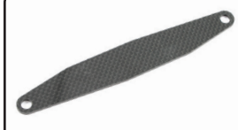
FTX6354 – FTX VANTAGE BATTERY COVER (CARBON) (1PC)