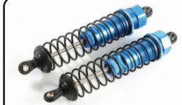
FTX6357 – FTX VANTAGE ALUM. REAR SHOCK (2PCS)