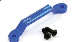
FTX6360 – FTX VANTAGE ALUM. STEERING ACKERMAN (1PC)