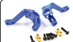
FTX6367 – FTX CARNAGE 2.0 ALUM. STEERING ARMS (2PCS)