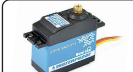
ET2069 – ETRONIX 15KG/0.16S DIGI WATERPROOF SERVO