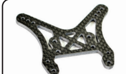
FTX6387 – FTX VANTAGE PRO FRONT CARBON SHOCK TOWER