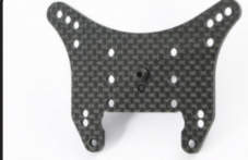
FTX6351 – FTX VANTAGE CARBON FRONT SHOCK TOWER