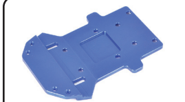
FTX6374 – FTX VANTAGE & ZORRO ALUMINIUM FRONT PLATE