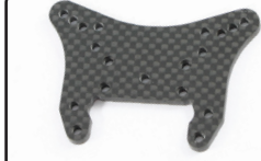
FTX6352 – FTX VANTAGE CARBON REAR SHOCK TOWER