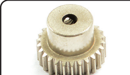
FTX6394 – FTX 48DP 26T PINION GEAR CONVERSION FOR VANTAGE