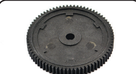
FTX6392 – FTX 48DP 73T SPUR GEAR CONVERSION - CARNAGE 2.0