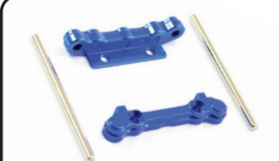
FTX6361 – FTX CARNAGE 2.0 AL. FRONT SUSP. HOLDERS (1SET)