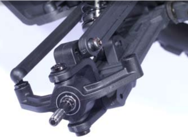
A ball raced live front axle means you can swap wheels front to rear and share the wear

proof driveline. The diff contains twin planetary gears that are almost the same size as the two bevel gears that take power out to the driveshafts, so the power is spread evenly across more teeth and hence the total strength of the assembly is improved tenfold. The diff is greased with a heavy lubrication to give better drive on loose surfaces but that soon spins away to leave a free rolling diff with an easy action so it will be well worth stripping the diff out occasionally to keep it greased up for a long working life.