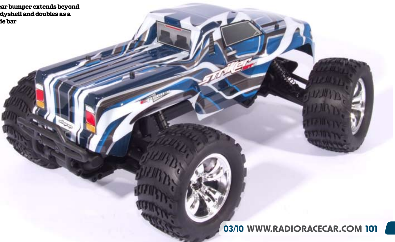
The rear bumper extends beyond the bodyshell and doubles as a wheelie bar

The huge tyres are pre-mounted with foam inserts, and glued to quad spoke chrome plated wheels, which are interchanged side to side and front to back to share the wear and extend their useful life. The tread pattern is directional, but such a simple pattern that I could not tell any difference when they were fitted backwards, so don't worry about that. The rims are vented so the tyres can breath and maintain maximum footprint for excellent grip, but water will spin into the tyre insert so if you are running in the damp be sure to nick the tyre and let the water spin out again rather than gather and weigh the wheels down. The radio gear and speed controller are not waterproof by any means and the bodyshell is a very loose fit to the chassis so it's not advised to go puddle jumping, but to run in the ice and snow we simply wrapped cling film around the whole chassis and then fitted the bodyshell, which worked a treat!