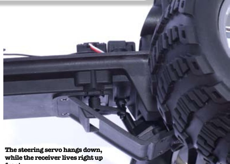
The steering servo hangs down, while the receiver lives right up front