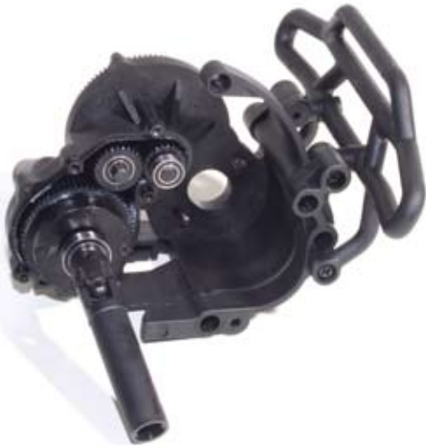
A fully ball raced driveline and all metal gears means it is one bullet-proof gearbox