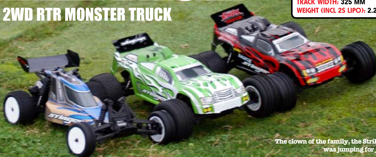
The clown of the family, the Striker was jumping for joy

If you are looking for a fun, easy to drive vehicle with a go anywhere attitude that can deliver fun by the bucket load yet requires minimum maintenance and set-up, the Step Up 'Striker' Monster Truck is for you. The huge multi-purpose tyres can handle anything, with a wide footprint and soft compound. They dig into grass, mud, AstroTurf and recently even entertained us for many happy hours on sheet ice over the school holidays and yet the tread pattern still look as good as new! A chassis with such high ground clearance means that even though it's 2WD you rarely get hung up, and the rear weight bias means it's frequently seen pawing the air in a power wheelie, which is always a