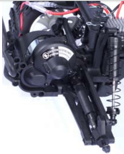
Telescopic driveshafts are the only way to cope with such long travel suspension