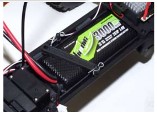
Slot in a Bionic 2S LiPo for some wheelie popping action. Just be sure to nibble the chassis front retainer wall to give some clearance for the balance lead

to a controlled halt if the trigger is squeezed, but will then engage forward motion as soon as the wheels stop turning, without having to return to neutral, and always with a very pleasing wheelie. In fact this little Monster will wheelie even from a standstill if there is sufficient grip available, probably helped by the fact that I chose to run the Bionic LiPo rather than the heavier NiMH more usually associated with RTR's. With less weight and more punch, longer lifetime and more cycles than a NiMH battery it's the obvious choice.